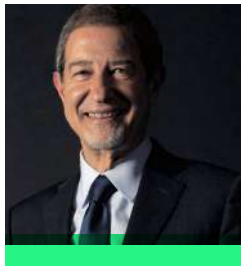
Nello Musumeci Minister for Civil Protection and Sea Policy of Italy