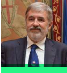
Marco Bucci Mayor of Genova The Grand Finale